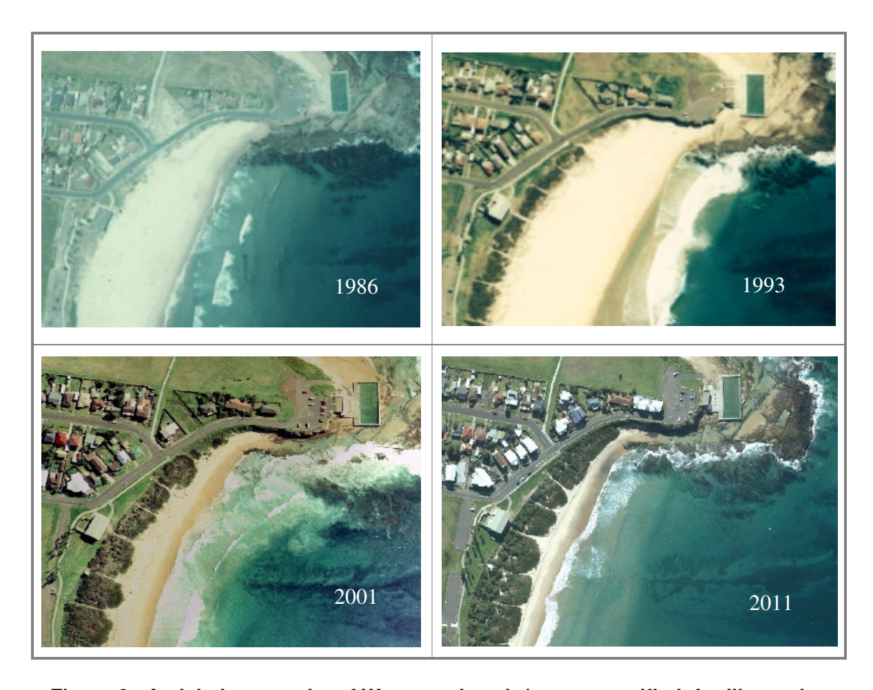
Figure 2. Aerial photographs of Woonona beach (not georectified; for illustrative purposes only)

In addition to the spatial spread of the vegetation, the foredunes have also increased in volume and height, and have prograded to within easy reach of moderate wave run-ups that are not necessarily associated with coastal storms. At some beaches, the increases have been more than twofold following the dune restoration works. With steep scarping and damage to beach access ways at beaches with vegetated dunes, and no such detrimental effects apparent at a small minority of beaches where dune works were not carried out, the community further questions the value of the dunes in their present form. Some impacted beaches are very slow to recover, even after a long period of fair weather, and sometimes the beaches need to be closed as a public safety measure.